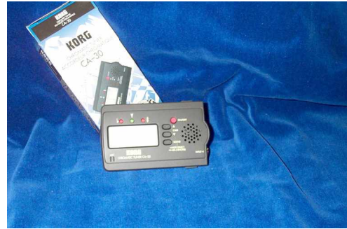
KORG CA-30 TUNER