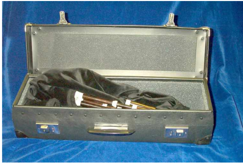
SMALL PIPE FIBRE CASE