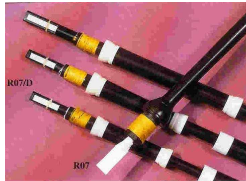
PLASTIC REEDS FOR SMALL PIPES